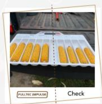
2020 trials; Precision Ag Research - Clarion, IA. Fulltec Impulse Corn 1 box/120 acres @V5