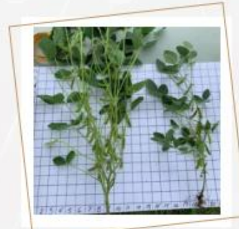
2020 trials; Precision Ag Research - Clarion, IA. Fulltec Impulse Beans 1 box/120 acres @V5